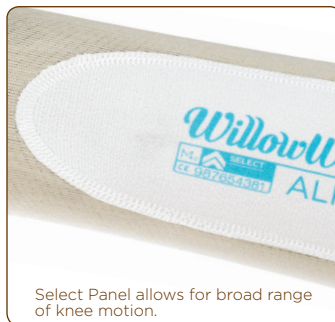
Select Panel allows for broad range of knee motion.