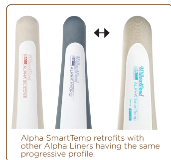
Alpha SmartTemp retrofits with other Alpha Liners having the same progressive profile.