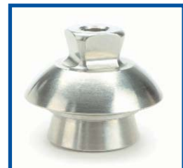
Knee Pyramid Part No 6PC508