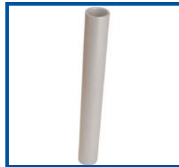
Aluminium Tube Part No 6PC509 250mmx30mm dia.