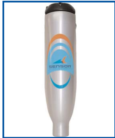
Part No 2SR500