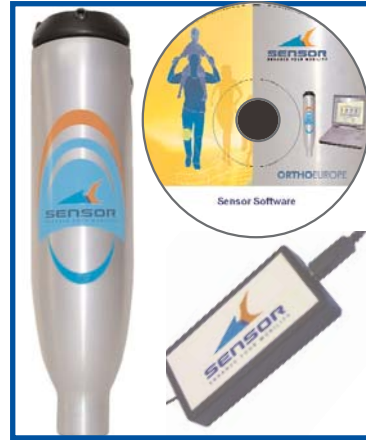
Part No 2SR501