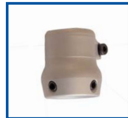
Tube Clamp Part No 6PC506